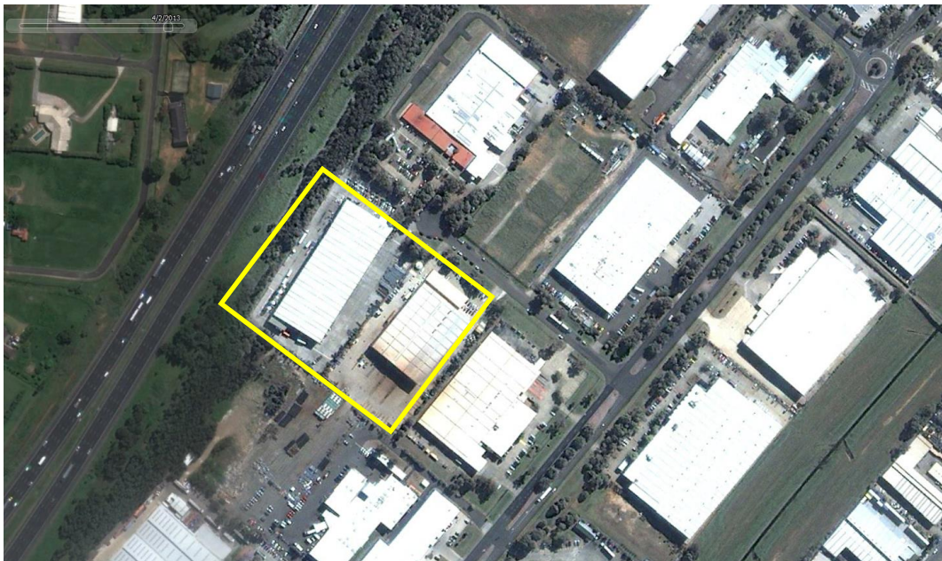
FIGURE 3.1 SITE LOCATION OF THE SUPAGAS GAS CYLINDER FILLING FACILITY INGLEBURN